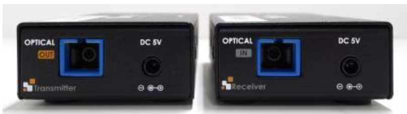
Fig. 4K optical extender image

7. Connect two(2) AC plugs to inlet of 19RM-001.