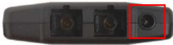
DC +5V Power jack