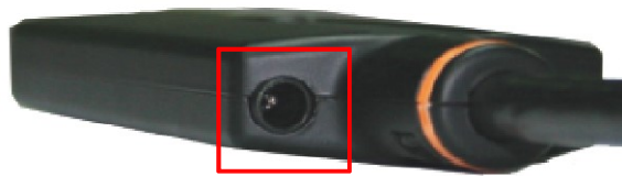
DC +5V Power jack

NOTE: The Transmitter module does not need to be externally powered unless the source device does not supply enough power through the DVI connector.